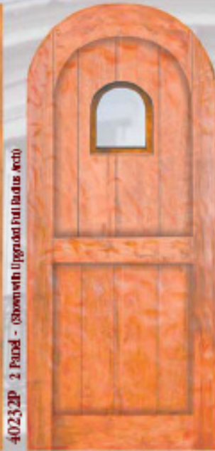
40232P 2 Panel - (Shown with Upgraded Full Radius Arch)

Fox Senior Panel - "F" Knotty Alder Rocky Mountain Distress