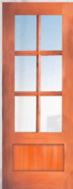
40061B 1 Panel - 6 Lite

Butcher Block Panel - "B" Select Alder True Divided Lites