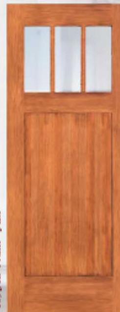
40931B 1 Panel - 3 Lite

Junior Hip Panel - "J" Oak True Divided Lites