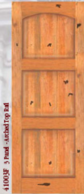
41003F 3 Panel - Arched Top Rail

Fox Senior Panel - "F" Knotty Alder Rocky Mountain Distress