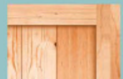
Planked Panel - "P" Pine is true T&G, other species are V-Groove

All doors feature butcher block design construction except interior doors made from pine or knotty alder