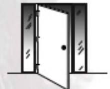
Right-hand unit interior side

Planked Panel - "P" Knotty Alder Rocky Mountain Distress 4 Panel Window