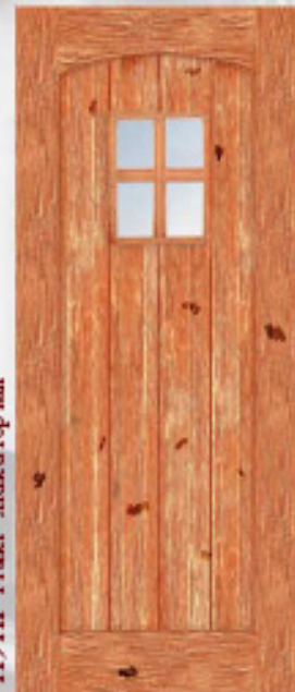
41941P 1 Panel - Arched Top Rail

Butcher Block Panel - "B" Soft Maple True Divided Lites