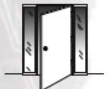
Left-hand unit interior side