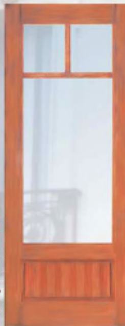
40031J 1 Panel - 3 Lite

Butcher Block Panel - "B" Select Alder True Divided Lites